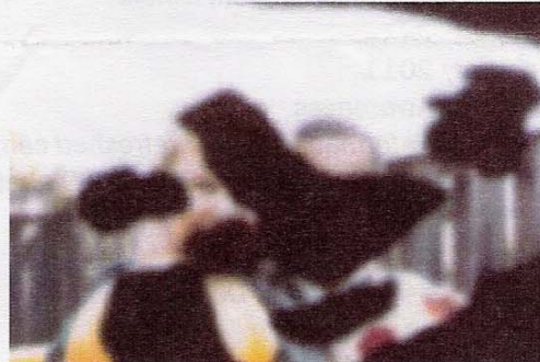
Same scene viewed by a person with diabetic retinopathy