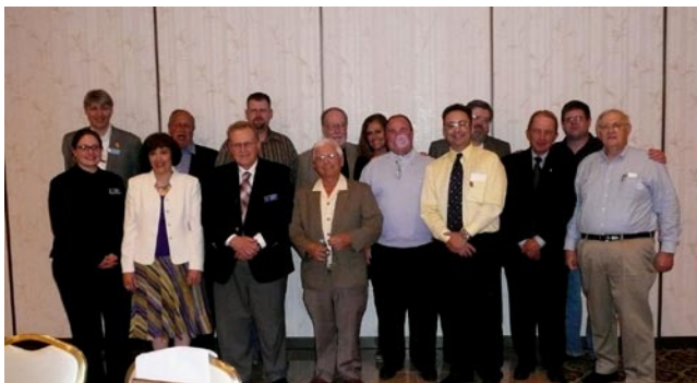
2009/2010 BOARD OF DIRECTORS