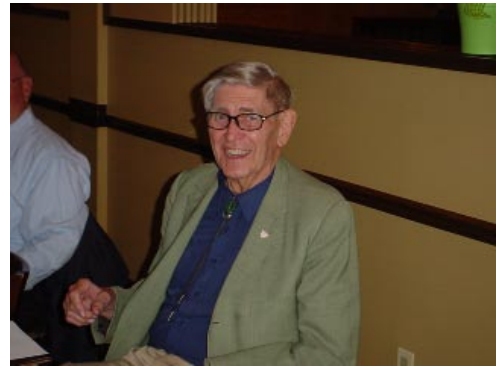
AN VERY OLD MEMBER BUT NOT FORGOTTEN