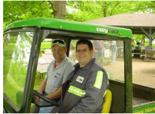
JR. BIGFOOT TEACHING HIS BUDDY LITTLEFOOT