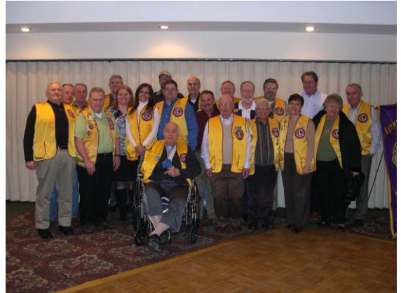
THE QUAD CLUB GANG FROM MOUNT PROSPECT