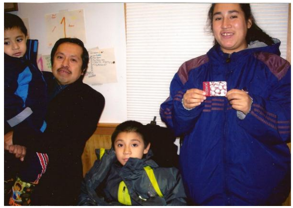
A HAPPY FAMILY WITH THEIR GIFT CARD