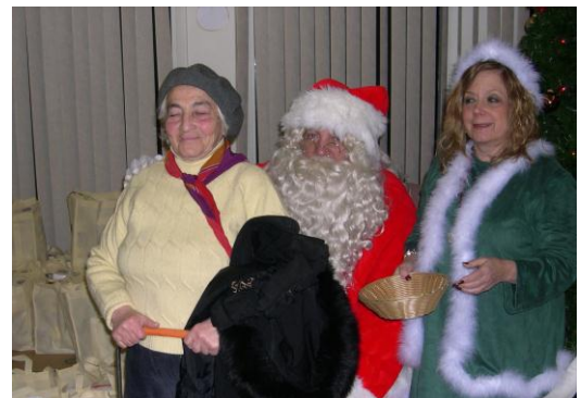
A HAPPY SENIOR WITH SANTA AND HELPER