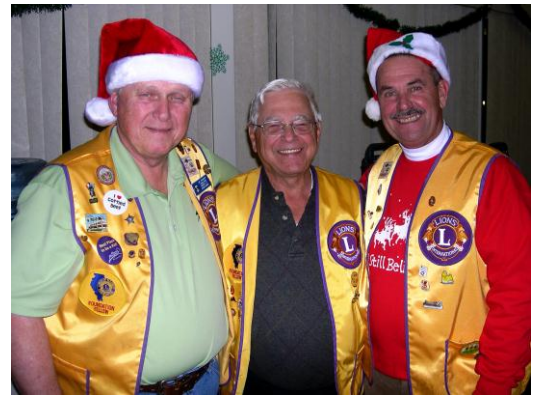
BARBER, ACCOUNTANT, AND BUILDER