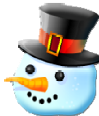
FROSTY THE SNOWMAN