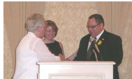
A FOUNDATION FELLOW