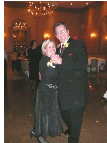
THE PROM QUEEN AND HER DATE