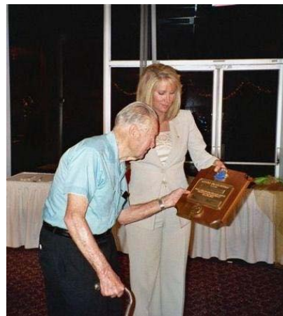
ONE OF OUR FALLEN MEMBERS RECEIVING THE MELVIN JONES AWARD