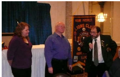
TWO OF OUR NEWEST MEMBERS BEING INDUCTED BY OUR DISTRICT GOVERNOR