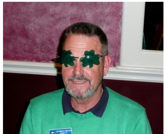
SOME LIONS ARE FUNNY NATURALLY OTHERS HAVE TO WORK AT IT