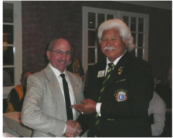
OUR NEWEST MEMBER AND THE INDUCTING OFFICER