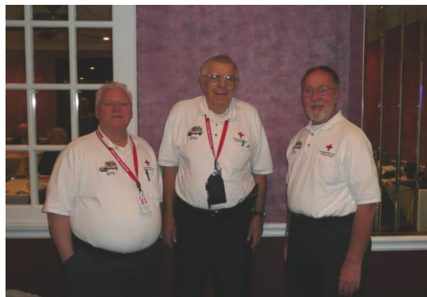
GUEST SPEAKERS AT OUR OCTOBER PROGRAM NIGHT "DISASTER SERVICE TECHNOLOGY TEAM"