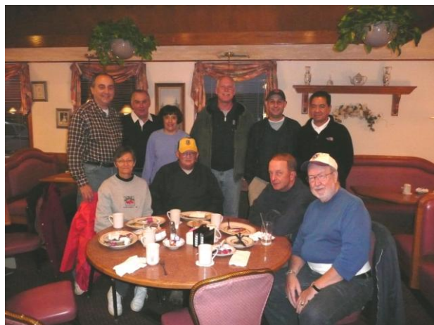
THE CANDY DAY BREAKFAST GROUP