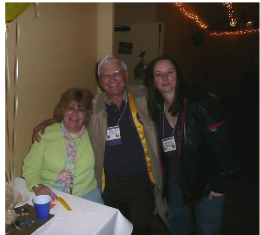
OUR DISTRICT TREASURER HAS HIS HANDS FULL AND ITS NOT MONEY