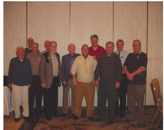
A GROUP OF THE VERY BEST