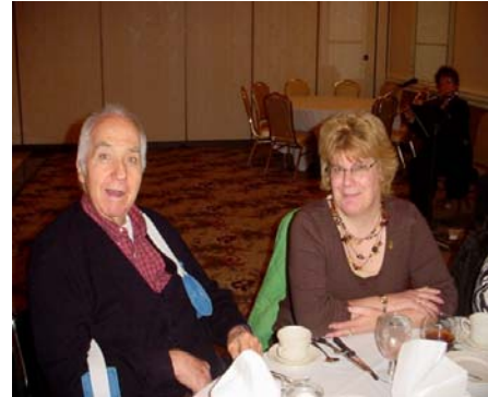
HARD TO EXPLAIN THIS ONE AGAIN??