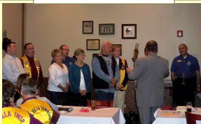
New members being inducted into the Club. November 2010.