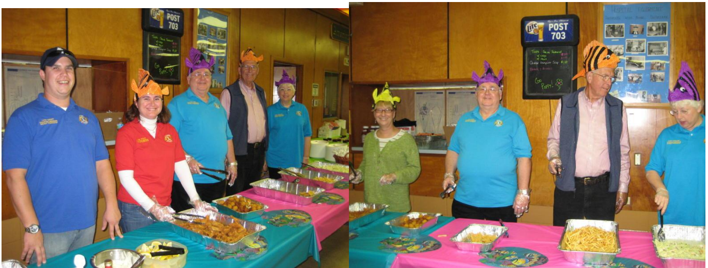
Grant Township Annual Fish Fry where we volunteer