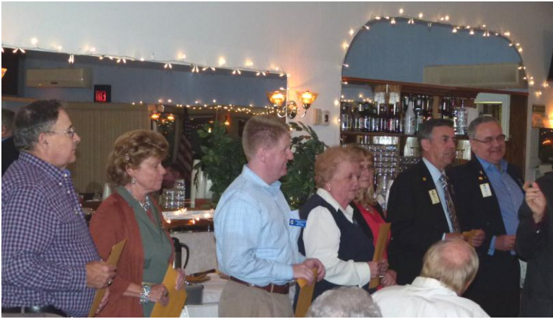
Lots of Lions join in on the entertainment