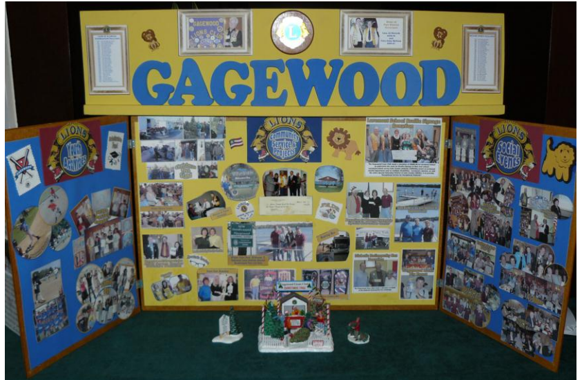
1 st Place Brag Board