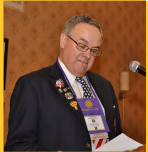
Governor Don Hook addresses the Convention

WANTED: Pictures of your Club activities and events for the newsletter. Please send with caption (including names) to: D1Fnewsletter@aol.com