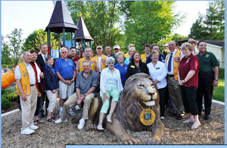
The Lake Villa Township Lions Club John Janega Memorial Park Ribbon Cutting in Lindenhurst on June 2, 2010