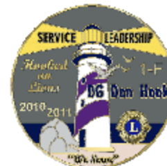
Lion 2VDG Den