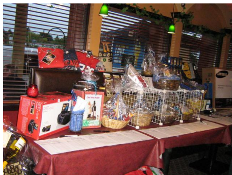
Silent Auction Table

"We want everyone to see a better tomorrow."